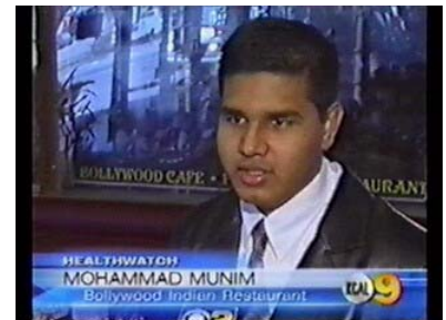
Munim: Always people have misconception about the Indian food. They think it's, you know, sometimes they think the spices, the spicy, it's bad for their health.