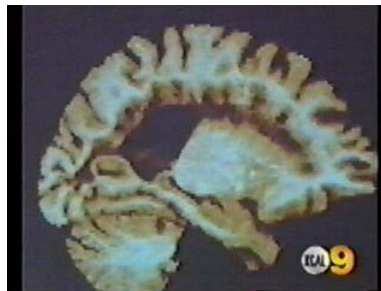
Alzheimer's disease is believed to be caused by a small protein toxin that results in inflammation and free radical damage in the brain. Antioxidants and anti-inflammatory agents are shown to protect the brain, reducing your risk of getting the disease.