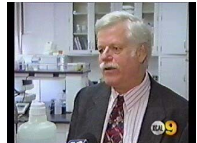
Cole: It directly attacks the toxin and prevents it from forming, or disaggregates it, and it also inhibits the response to the toxin, which is this inflammation and oxidative damage, so you've got a multi-pronged attack on the disease.