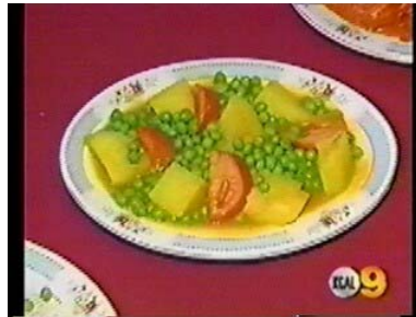
It's not a food everyone likes, but those who do usually can't get enough of it. And now we're learning that one of the most common spices used in Indian food, curry, not only tastes good but has an added benefit, a big one.